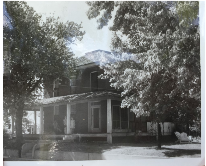
The Sweet House, circa 1950's. Note the white lawn chair on the right which can be seen in the photo below.